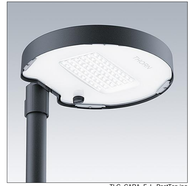
TLG CARA F L PostTop.jpg