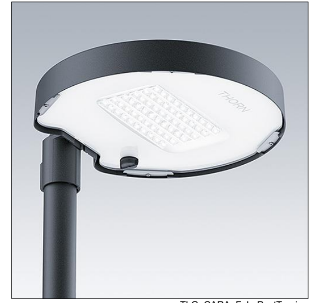
TLG CARA F L PostTop.jpg