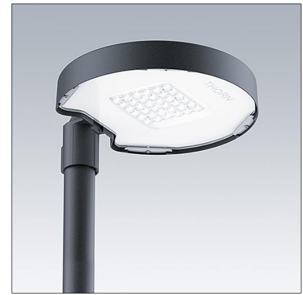
TLG CARA F S PostTop.jpg