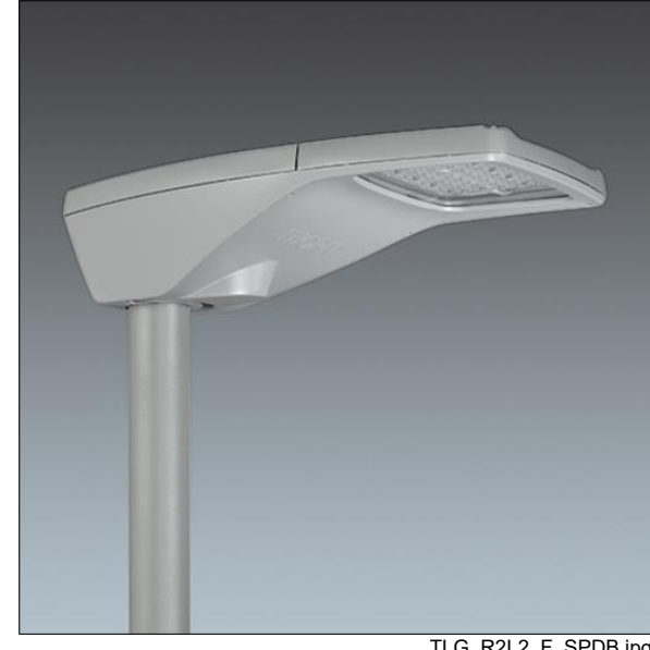
TLG R2L2 F SPDB.jpg