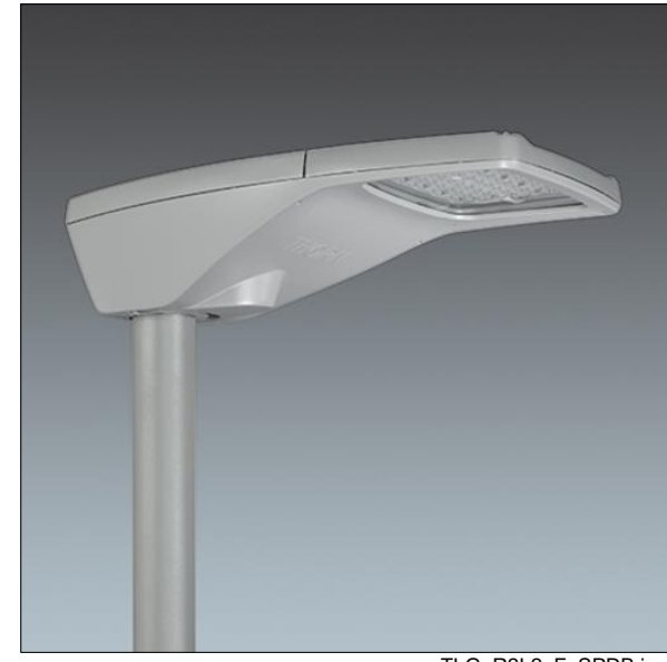
TLG R2L2 F SPDB.jpg