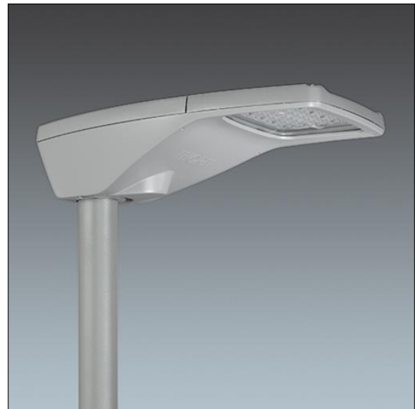
TLG R2L2 F SPDB.jpg

Dimensions: 655 x 362 x 155 mm Luminaire input power: 28 W Luminaire luminous flux: 3402 lm Luminaire efficacy: 122 lm/W Weight: 8.89 kg Scx: 0.05 m<sup>2</sup>