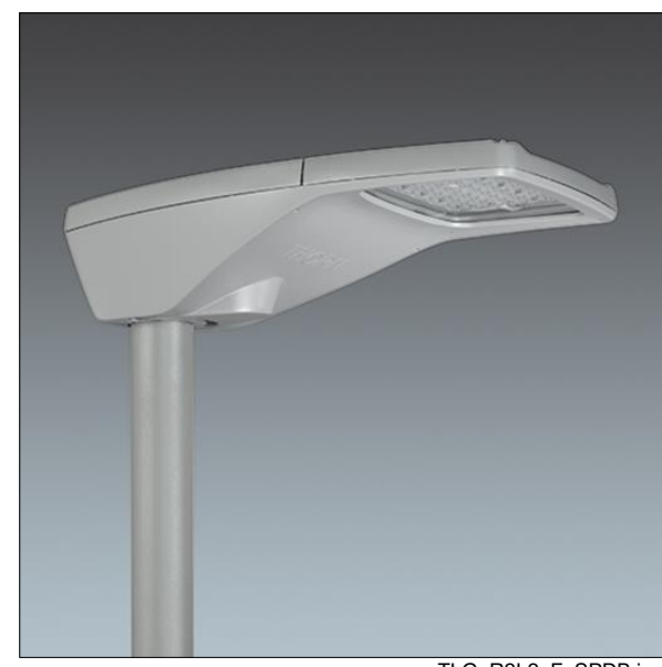
TLG R2L2 F SPDB.jpg