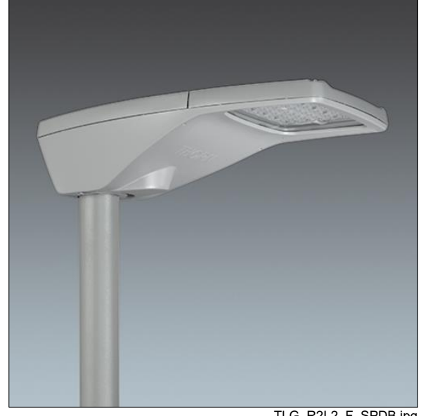
TLG R2L2 F SPDB.jpg