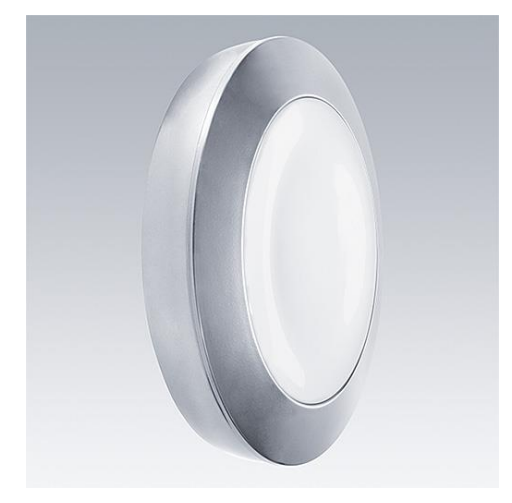
Photographs, line drawings and photometric data are representative only. For specific product detail please select an individual product.